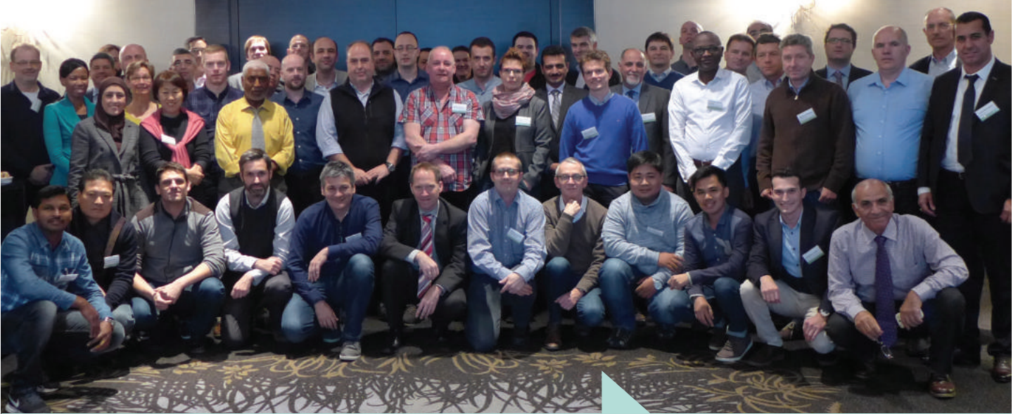
Multi annual cooperation between Vassiliko Cement Works and the multinational company Magotteaux